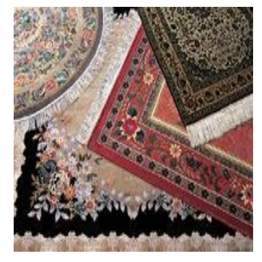
Our first-class Chinese rugs