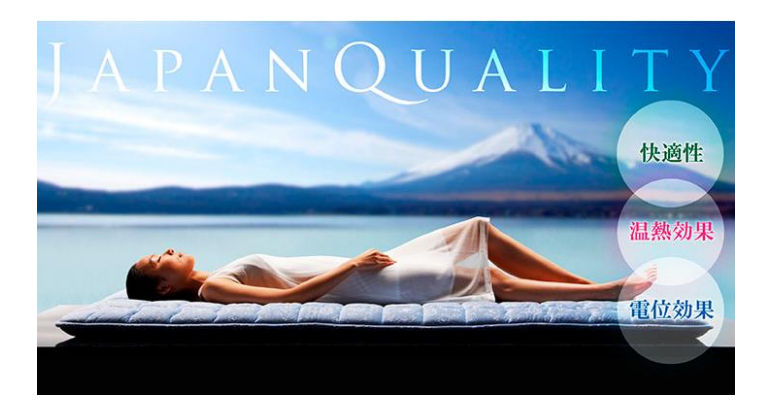
Our long-selling Kenko-Ichiban mattress