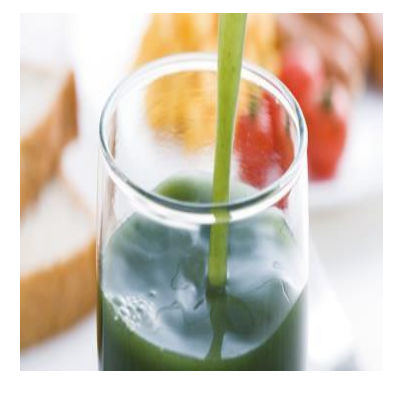
Our health supplements: Kinji-so in Kanazwa