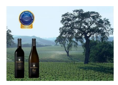
Our premium wine from Summerwood Winery