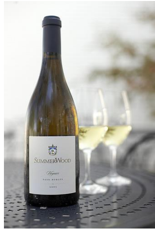
"To provide our customers with truly genuine and high-quality products."

This is our vision and business practice. We truly value our customers and are committed to providing the best possible hospitality whatever way we can. Therefore, we feel that it is our obligation to offer not only the best , but the right products that would truly meet & exceed every customer's expectations.