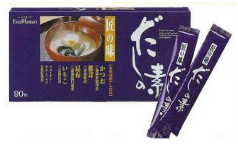
Natural Soup Powder