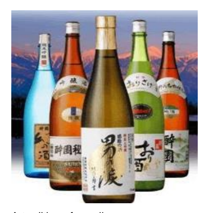
A tradition of excellence: Our Japanese sake & spirits